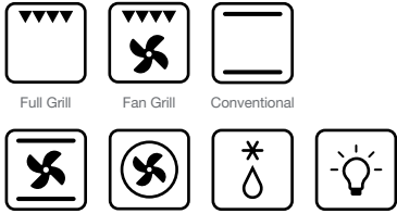
Full Grill Fan Grill Conventional Fan Assist Fan Forced Defrost Light