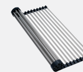
Rollermat Model Code: BDRM40X