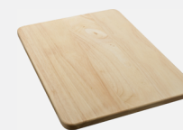
Chopping Board Model Code: BDCB30K