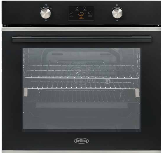
IB6010FRC Black: IB6010FRC